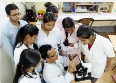
Practical Learning in Group