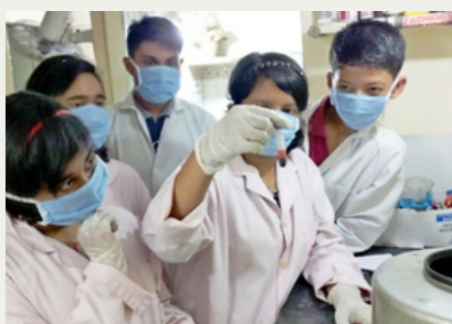
Practical Learning at Laboratory

One of the hallmarks of Amplicon is its emphasis on practical learning experiences . Amplicon instills in them the critical thinking abilities and problem-solving skills vital for effective leadership in any field.