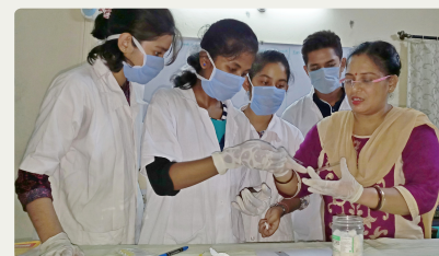
Hands on 'Smear Preparation'